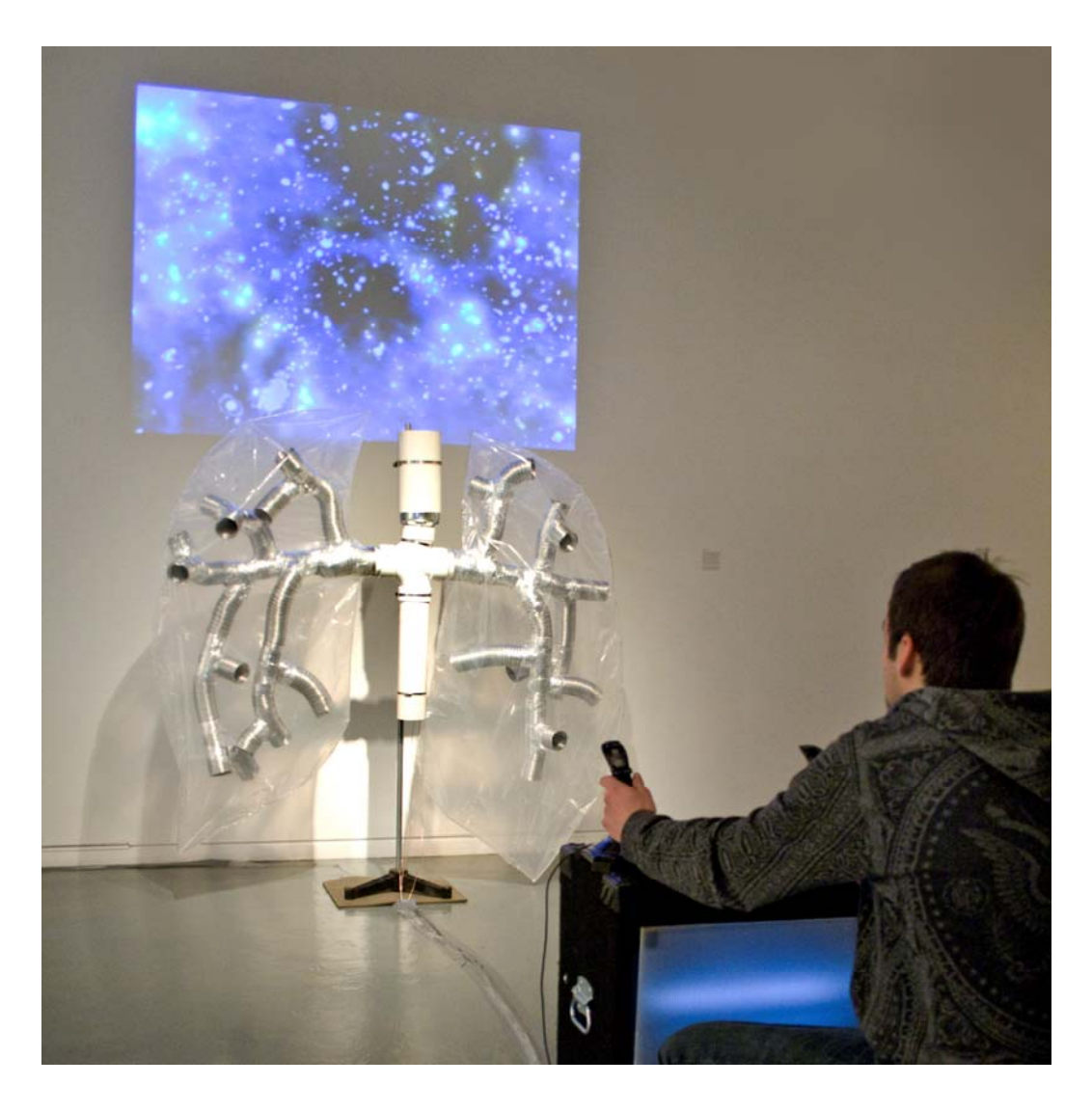
Sonic Primordia, 2010