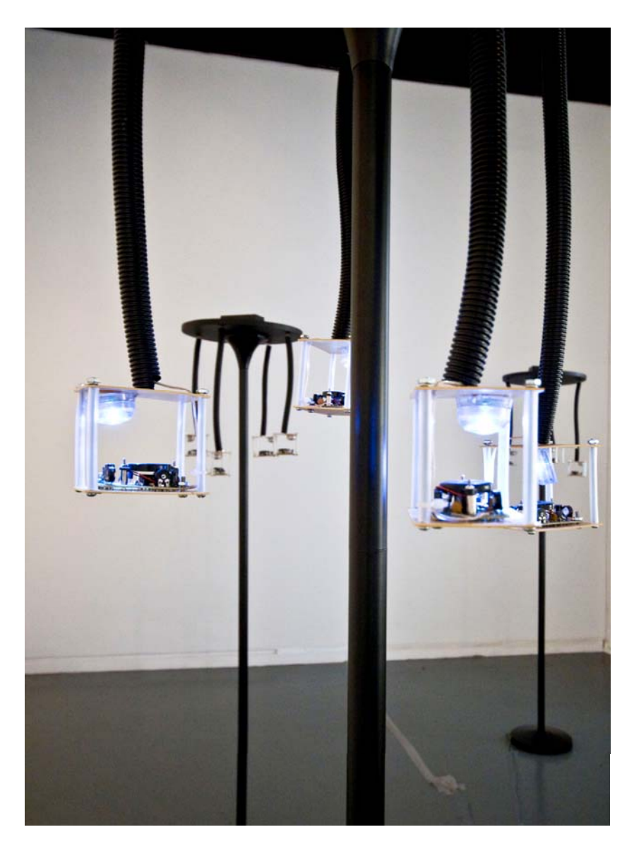
"8 Bit Cricket Chorus," 2010