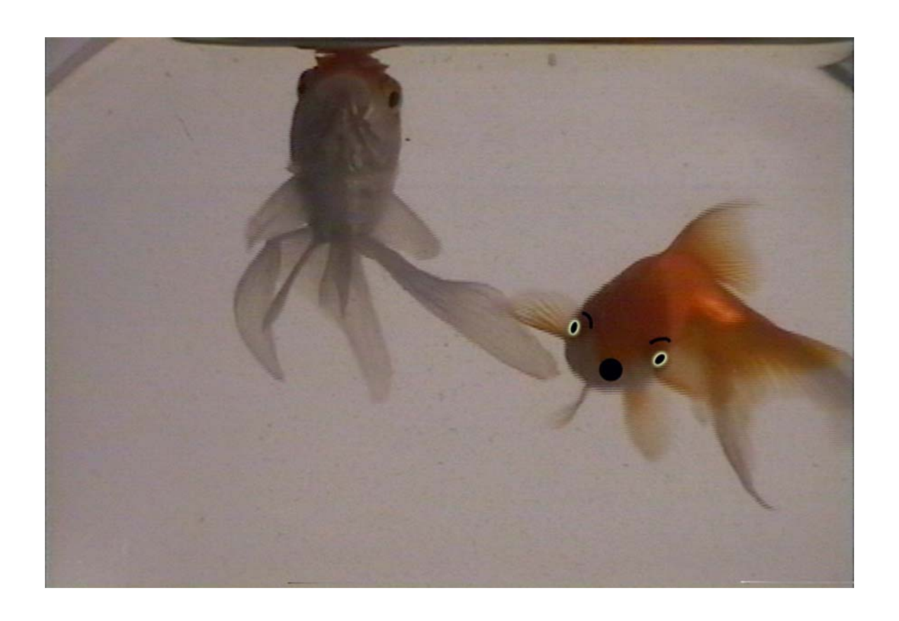
City Fish, 2008